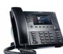
Mitel 6869 SIP Phone

The Mitel 6869 SIP Phone has a large 4.3" colour display, powerful crystal clear HD audio, and 12 programmable soft keys. Dual Gigabit Ethernet ports, magnetic keyboard interface, native DHSG/EHS headset support, and choice of expansion modules.