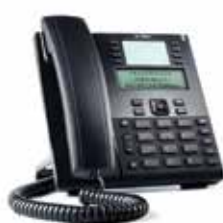
Mitel 6865 SIP Phone

The Mitel 6865 SIP Phone offers exceptional value in a fully featured, expandable IP phone. It has eight programmable keys, XML capabilities, Expansion Module and native DHSG / EHS support and Gigabit throughput for PC connectivity.