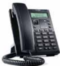
Mitel 6863 SIP Phone

This 2-Line SIP Phone with 2.75" graphical monochrome LCD display, programmable hard keys, and smaller desktop footprint is an ideal option for business environments that have light telephone use requirements.