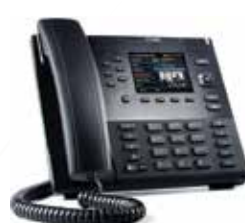
Mitel 6867 SIP Phone

The Mitel 6867 SIP provides HD wideband audio and an enhanced speakerphone, a large colour LCD display, dual port GigE, six programmable soft keys, four context-sensitive system keys, native DHSG/EHS headset and Expansion Module support.