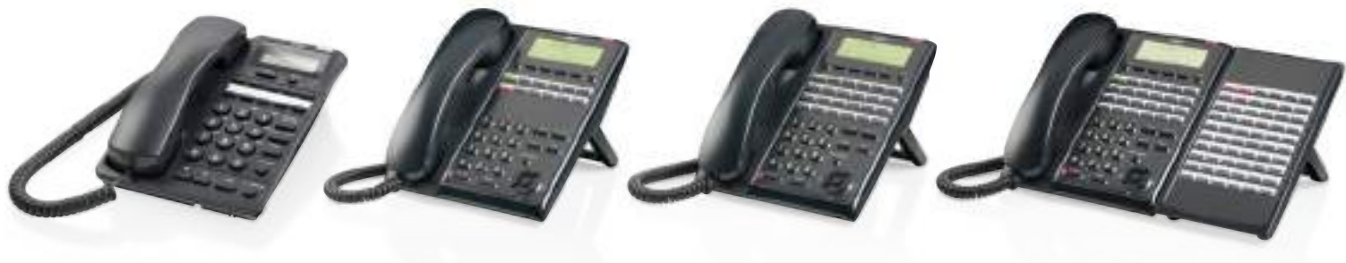
Digital and Analogue Handsets: Easy call control from the office