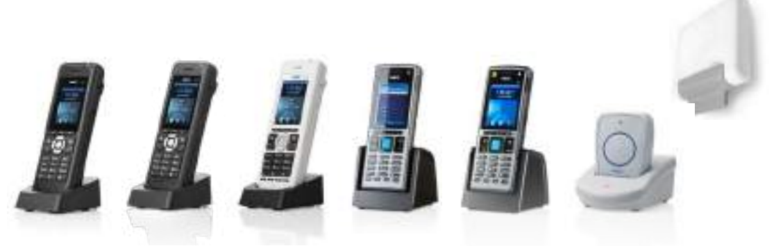
DECT: Cordless freedom for any working environment