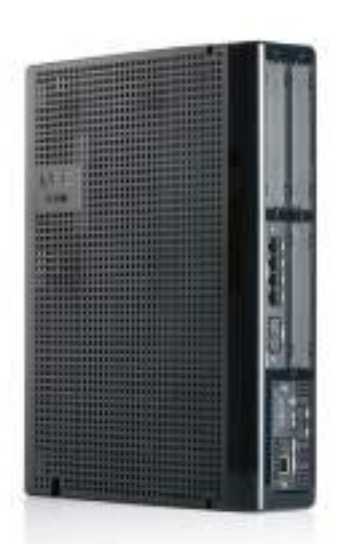
SL2100 Communication Server: Scalable from 5 to 100+ users