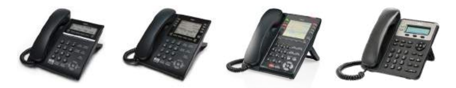
IP Handsets: Easy call control from the office, remote office or homeworking, hot-desking