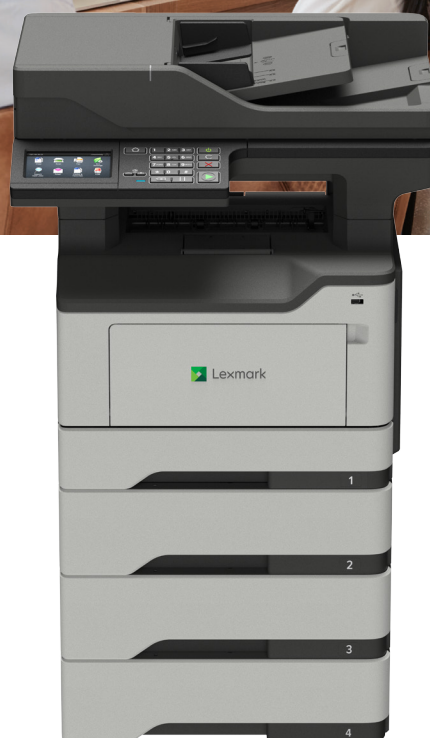
XM1246 with optional trays